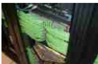
Cat 6 Cables displayed