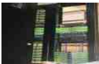
Switches with Racks Displays

Eight Chassis switches of 4500 series from Cisco were proposed. These high end switches have capabilities for VLAN and also for setting up VLAN policies and Inter-VLAN Routing. CAT 6 cables of Systimax (formerly Avaya Global) were used to network all the four floors. This solution was proposed keeping in mind scalability of the backbone. Four dual core gigabit Ethernet switches of Cisco 4510 series were used in the core for redundancy.