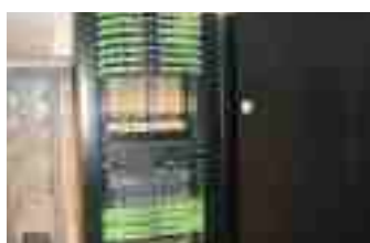
Cat 6 cables with Jack panel displayed