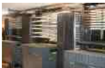
Catalyst 4500 Series Switches