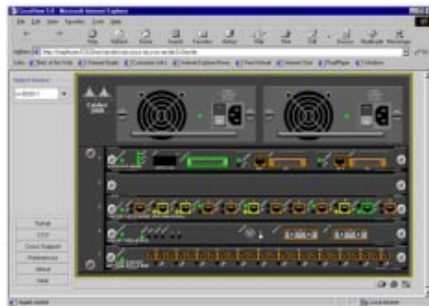
Figure 2 CiscoView Graphical Interface